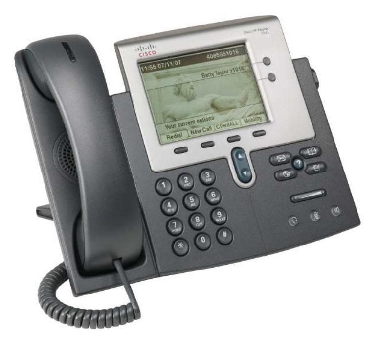
Figure 1. Cisco Unified IP Phone 7942G

The Cisco Unified IP Phone 7942G (Figure 1) is a full-featured IP phone with speakerphone and handset designed for wideband audio. It is intended to meet the needs of needs of transaction-type workers with significant phone traffic. It has two programmable backlit line/feature buttons and four interactive soft keys that guide you through all call features and functions. The phone has a large, 4-bit grayscale graphical LCD (Figure 2) that provides features such as date and time, calling party name, calling party number, digits dialed, and presence information. The crisp graphic capability of the display allows for the inclusion of higher value, more visibly rich Extensible Markup Language (XML) applications, and support for localization requiring double-byte Unicode encoding for fonts. A hands-free speakerphone and handset designed for hi-fidelity wideband audio are standard on the Cisco Unified IP Phone 7942G, as is a built-in headset connection and an integrated Ethernet switch.